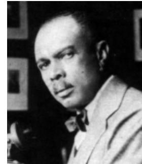
James Weldon Johnson